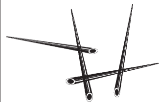
Assorted graphite or fiberglass